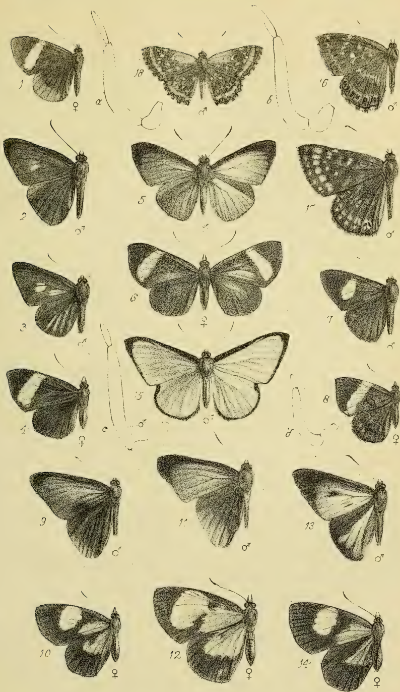
Species of Aricoris &c.